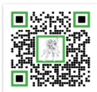
ST. MICHAEL'S QR CODE

Simply open your phone's camera, hover over the QR code of the parish you would like to donate to and click the link that appears!