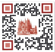
ST. PETER'S QR CODE

Thank you for giving, your donations make a difference!