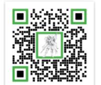
ST. MICHAEL'S QR

Simply open your phone's camera, hover over the QR code of the parish you would like to donate to and click the link that appears!