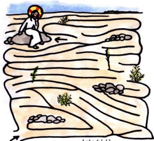
Jesus spent 40 days in the desert preparing for His work. During Lent we spend 40 days getting ready to celebrate Jesus' death and resurrection.

Can you find your way into the desert to be with Jesus?