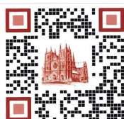
ST. PETER'S QR

Simply open your phone's camera, hover over the QR code of the parish you would like to donate to and click the link that appears!