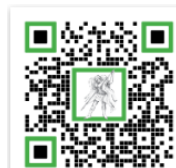
ST. MICHAEL'S QR

Simply open your phone's camera, hover over the QR code of the parish you would like to donate to and click the link that appears!