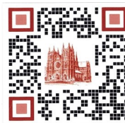
ST. PETER'S QR

Simply open your phone's camera, hover over the QR code of the parish you would like to donate to and click the link that appears!