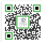
ST. MICHAEL'S QR

Simply open your phone's camera, hover over the QR code of the parish you would like to donate to and click the link that appears!